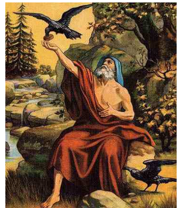
The ravens feeding Elijah

So this summer, as we read Elijah, Elisha, Amos, Hosea, Isaiah, and Jeremiah, I ask us all to do this: Listen to the words of the prophets. Take them into your