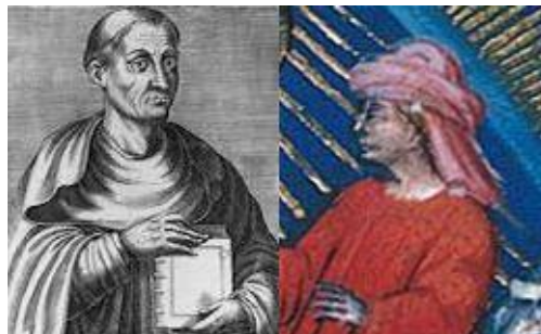
Hugh and Richard of St. Victor

Adapted from Richard Rohr. The Naked Now: Learning to See as the Mystics See New York: Crossroads Publishing Company, 2009. 28-29